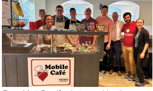
Rep. Matt Bradford stopped by the Variety Mobile Café located in the Meadowood Senior Living complex. The Mobile Café provides people with disabilities the opportunity to gain valuable work experience while making meaningful connections with local community members.